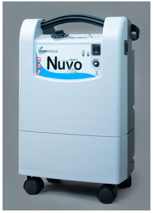
Nuvo Lite (Model 925) shown for reference.